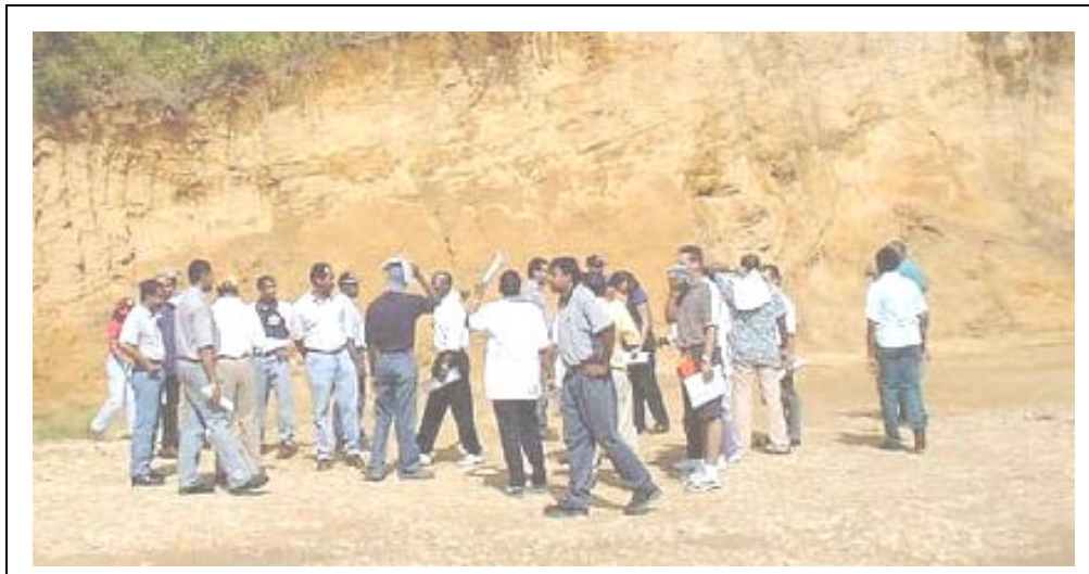
Section of the participants examine an outcrop within the Morne L'Enfer Formation