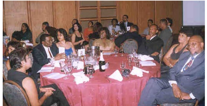
A section of the audience enjoys the proceedings at the Trinidad Hilton.